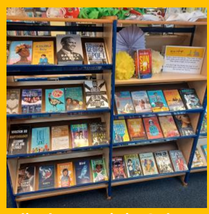
The Library display on Lit in Colour